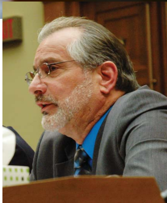
Top: Rep. Darrell Issa (R-CA) at a congressional hearing in 2011

So instead of shifting emphasis away from pre-funding, Issa’s H.R. 2309 pretends to offer the USPS short-term relief by dropping to $1 billion last year’s pre-funding payment obligation (which Congress deferred to this summer). By 2015, though, the annual pre-funding schedule rockets to an unimaginable $8 billion.