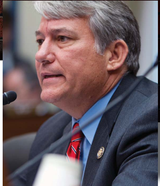
Rep. Dennis Ross (R-FL)