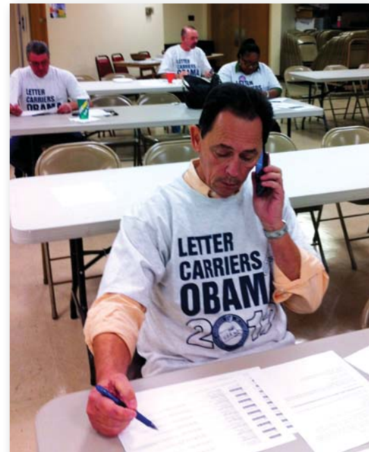
Top left: Labor walkers in Sedalia, MO Branch 139

“I know that we can rely on you, wherever you live, whatever your political views, to help get our message out and to let friends, neighbors, customers and lawmakers know the importance of retaining the world's best delivery network.” ✉