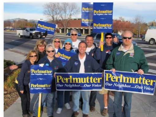
Below: Carriers took to the street to help re-elect Rep. Ed Perlmutter (D-CO).