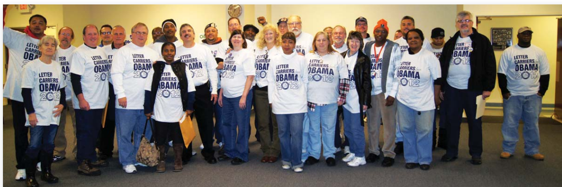
Below: Cleveland, OH Branch 40 members head to a rally.