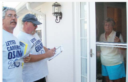
Top: NALC members with Rep. Jo Ann Emerson (R-MO).

And they voted against the candidate who spoke of privatizing the U.S. Postal Service and whose party platform stood