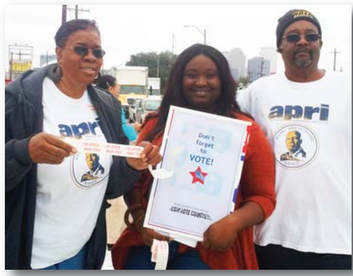
Bottom: Workers in Illinois prepare for a rally to promote workers' issues.