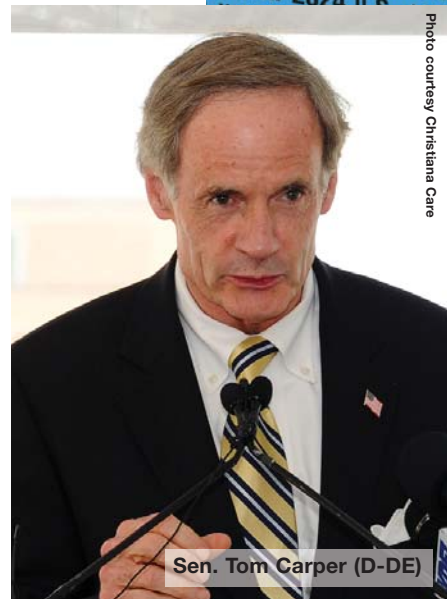
Sen. Tom Carper (D-DE)