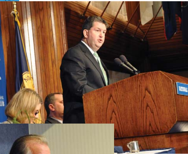
Postmaster General Patrick Donahoe discusses the Postal Service's financial crisis at the National Press Club on Nov. 21.

pre-funding requirement, it all but guarantees the elimination of Saturday and door-to-door mail delivery, which not only will threaten 80,000 good-paying