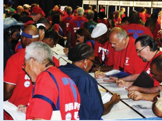
NALC members vote for AFL-CIO delegates.