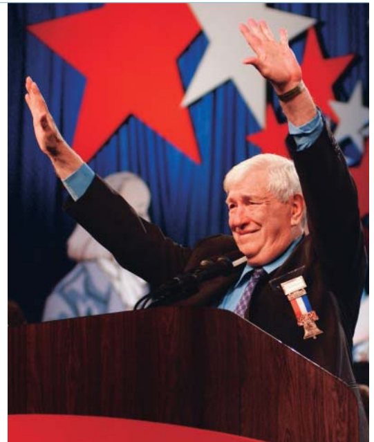
Top: Sombrotto announced his retirement at the National Convention in 2002.

The following pages reflect the legacy of Sombrotto's service to the NALC.