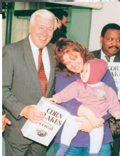
Right: The "kids and corn flakes" kickoff ceremony for an early national food drive.