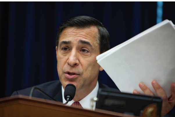
Rep. Darrell Issa (R-CA)

“Just as the budget sequester has thwarted a strong economic recovery,”