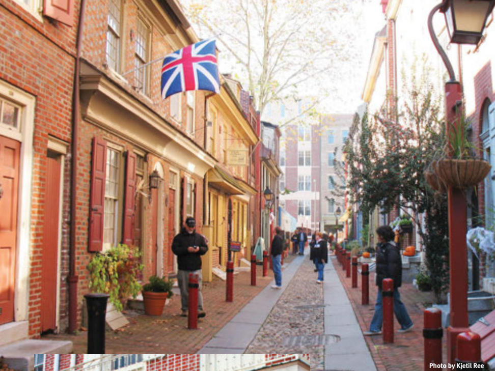
Left: Elfreth's Alley