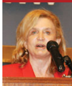
Rep. Carolyn Maloney (D-1)