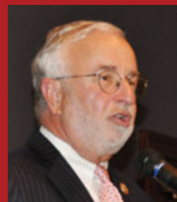
Rep. Tim Bishop (D-1)