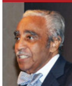
Rep. Charles Rangel (D-13)