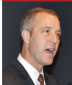
Rep. Sean Patrick Maloney (D-18)