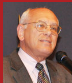
Rep. Paul Tonko (D-20)