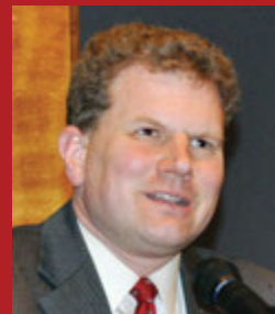
Rep. Dan Maffei (D-24)