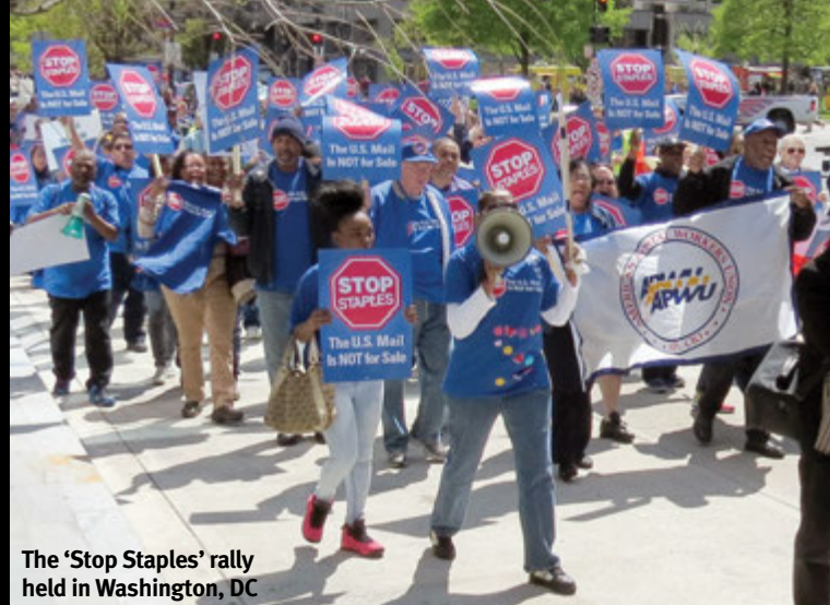
The ‘Stop Staples’ rally held in Washington, DC