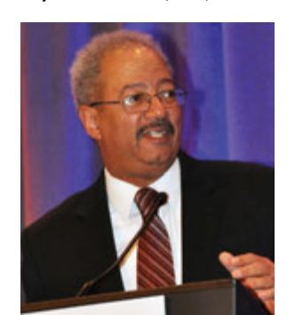
Rep. Chaka Fattah (D-PA)